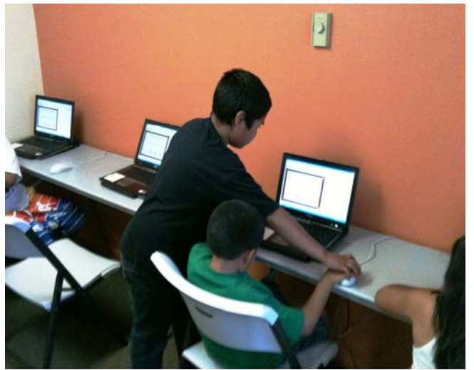
Kids helped each other in the class!